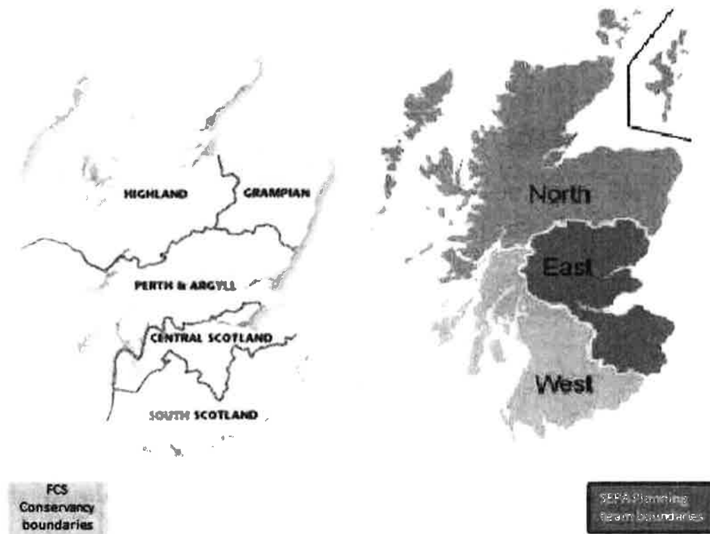
Figure 2: FCS Conservancy and SEPA Planning Team boundaries